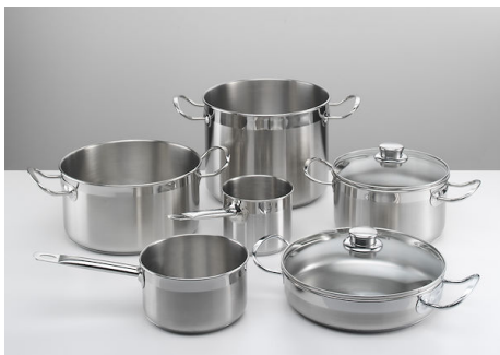
Induction Pro - Cookware set - 8pcs 8210 008